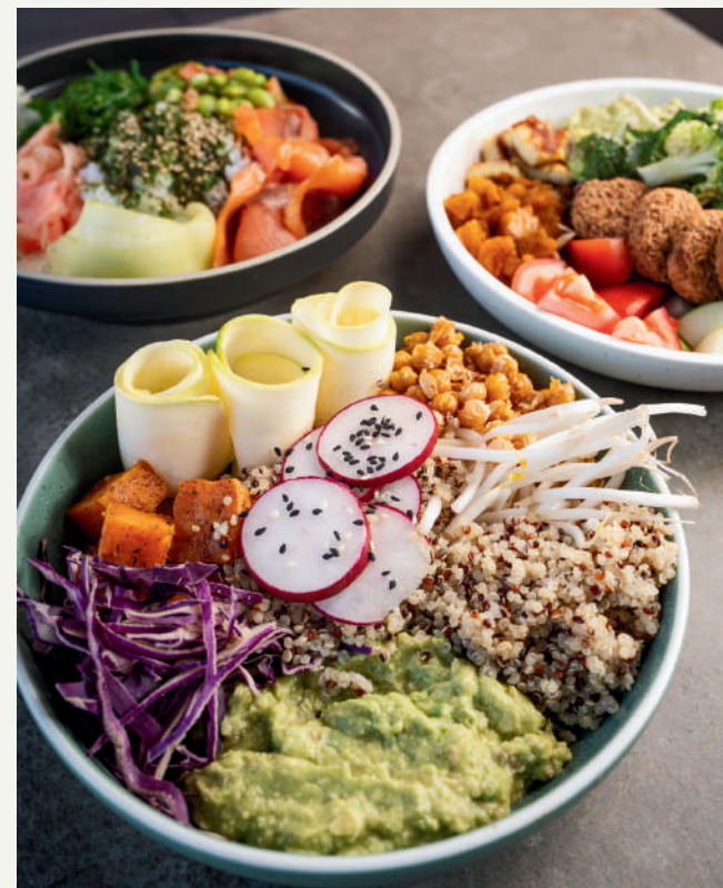
Tokyo Salmon Bowl, Bali Bowl, and Noosa Bowl