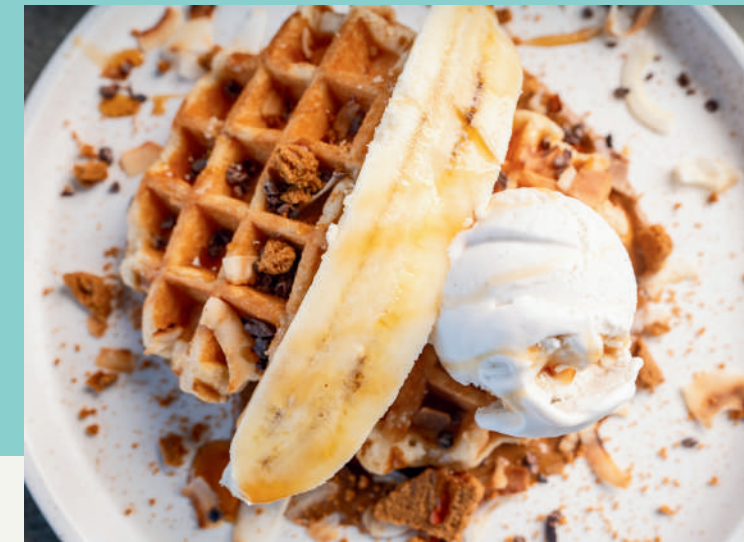
Biscoff Banoffee Waffle

+BBQ 2 +Aioli 2 +Truffle Mayo 2 +Sriracha Mayo 2