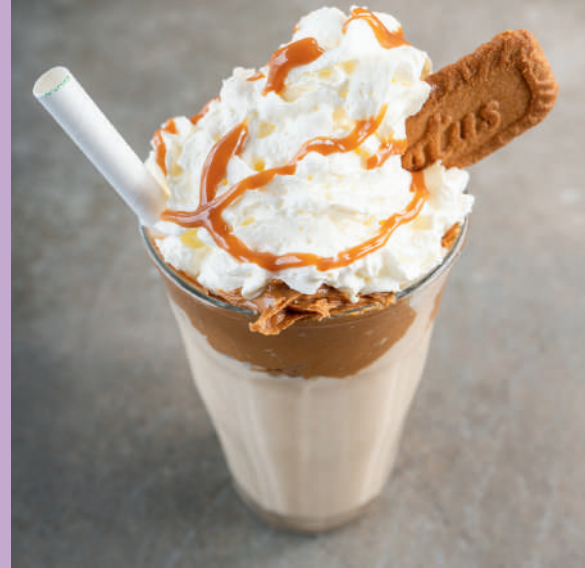
Biscoff Milk Shake