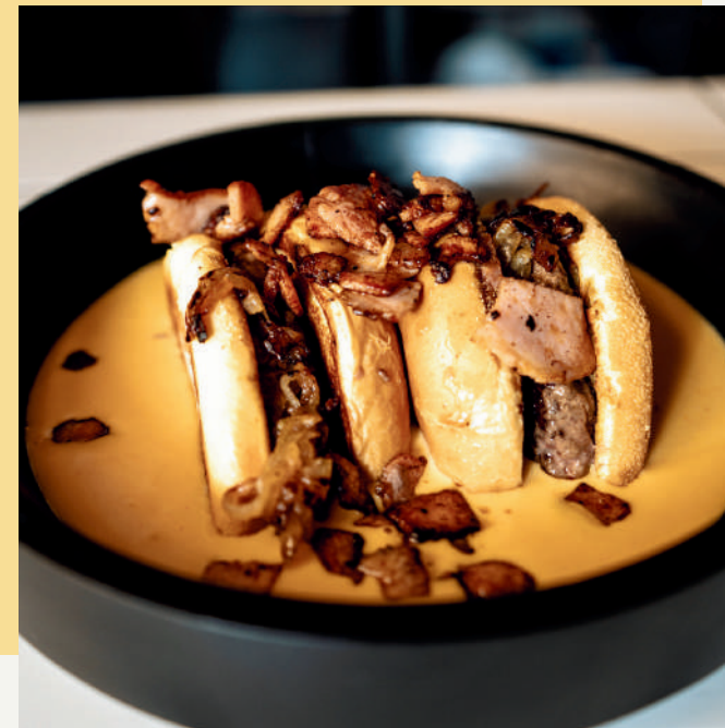
Ultimate Wagyu Burger

Southern fried chicken with crispy bacon, grilled pineapple, cheddar cheese, cos lettuce, tomato, pickles, sriracha mayo, all on a brioche bun with shoestring fries and tomato sauce